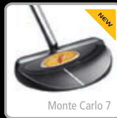
Monte Carlo 7