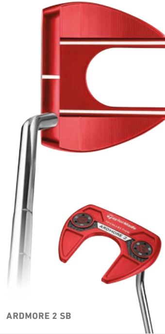
ARDMORE 2 SB