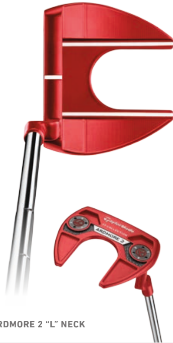
ARDMORE 2 "L" NECK